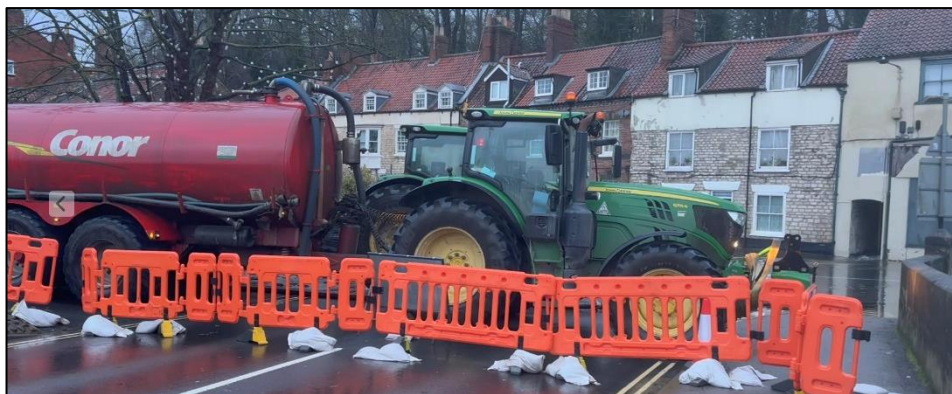
County Bridge closed in December 2023 by tractor-towed tankers pumping water from one side of Castlegate to the other, due to the lack of permanent flood alleviation infrastructure